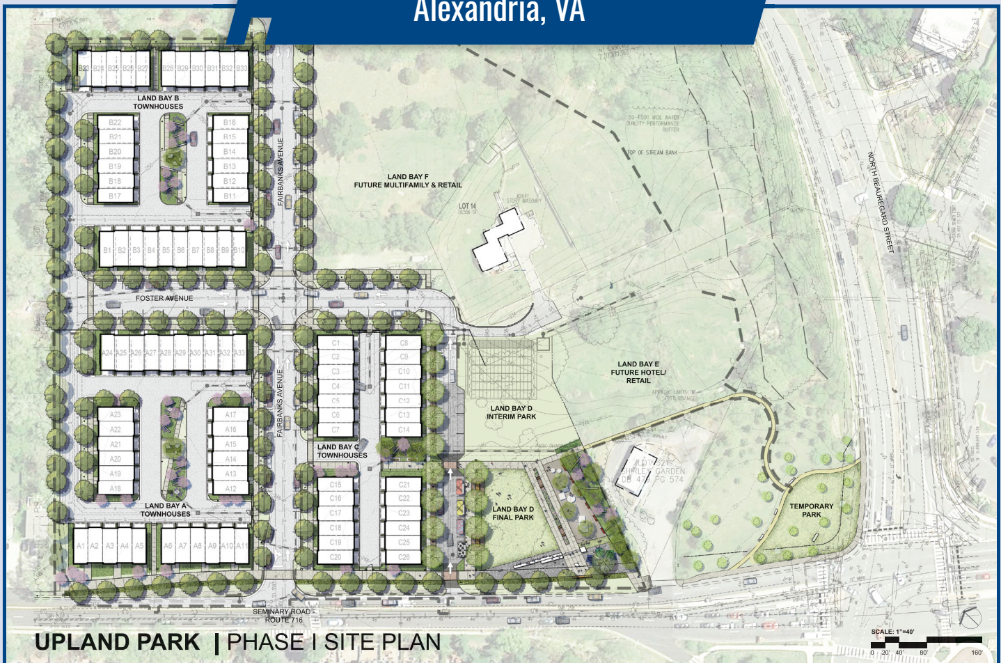
UPLAND PARK | PHASE I SITE PLAN